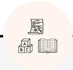
CHILD-FOCUSED WITH PARENT & CAREGIVER ELEMENTS

This could include early childhood development with parenting skills; family literacy with health screenings; and/or other child-focused services that also identify ways to support the adults in their lives.